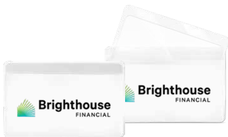
1201 Credit Card Magnifier $2.26A Min. 200*

Useful and clever promos have great brand "Staying Power". Customers will keep them long after they toss the letter, and will be reminded of you with every use. Here's a few fresh, flat & mailer-ready promos to up your next campaign.